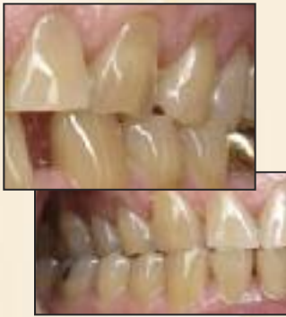
Fig. 1 Lateral view of patient with missing tooth and evidence of unusual wear, with contralateral view showing excessive wear due to poor anterior guidance.