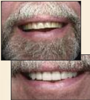
Fig. 5 Comparison of patient's pre-treatment tooth wear and final result after upper anterior restoration.