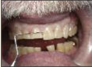
Fig. 4 Partial restoration of upper anterior teeth using composite material.

The patient granted permission to meet on another day in order to properly evaluate the findings, present a diagnosis and make the required treatment recommendations. Because the patient was able to clearly understand his dental problem with the aid of BiteFX animations, the treatment plan was extended well beyond a simple replacement as described in the Treatment section above. The client was extremely pleased with his results.