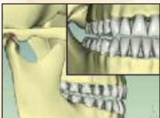
Fig. 3 BiteFX animation with side-by-side animation to explain normal anterior guidance.